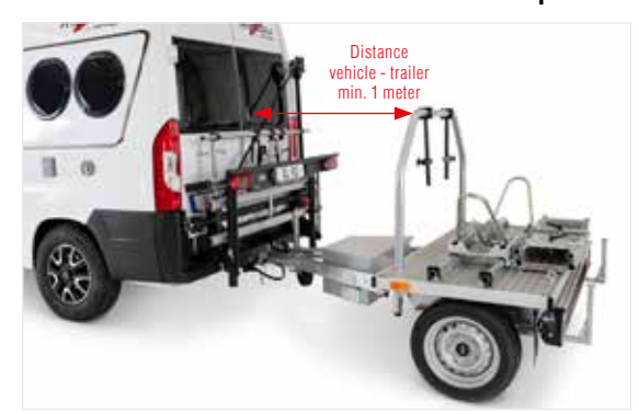
Towbar can be used without restrictions