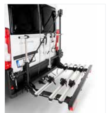
Set up kit for 3 e-bikes or bicycles